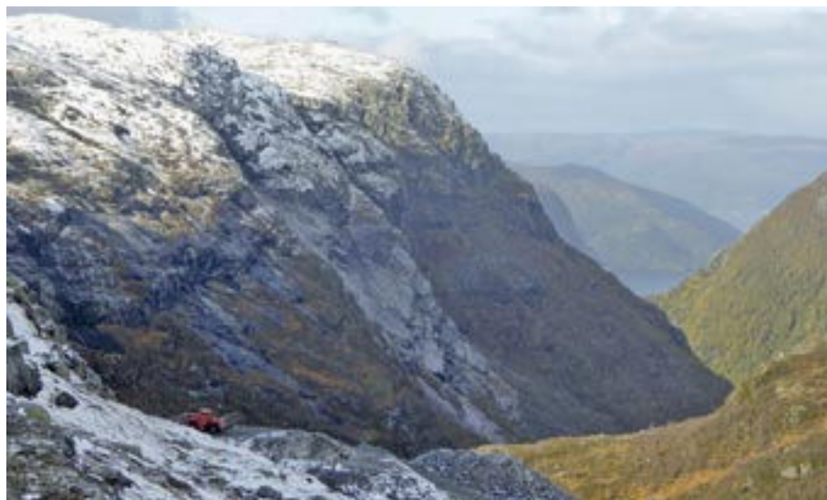
The ability to disassemble the LH202 into several smaller pieces proved decisive on the Østerbø project where all required material had to be transported to the work site by a helicopter with a maximum capacity of 3,700 kg

"Moreover, the Sandvik LH202 dimensions are well suited for water tunnel preparation, as