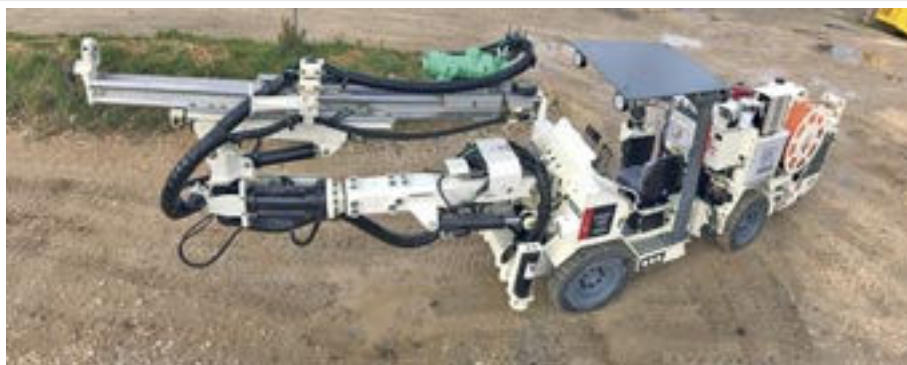
Aramine's diesel-electric hybrid miniDriller DM901 HDE drill rig uses the diesel engine for tramping and electric motor for drilling

DA: It would be Romeo & Juliet first, and we're targeting late-August/September with the trial lasting around two months.